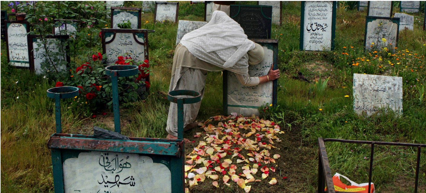
A Kashmiri woman kisses the tombstone of her son at martyrs graveyard in Srinagar, Kashmir. Below: A young Kashmiri boy shouts pro-freedom slogans (Azadi) during a protest on the outskirts of Srinagar, Kashmir