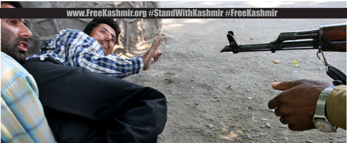
One of the 800,000 Indian soldier holds two Kashmiri civilians on gun point as they duck for cover. Srinagar, Kashmir

www.FreeKashmir.org #StandWithKashmir #FreeKashmir